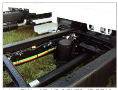
LOCATION OF AIR DRYFR (IF REOD)