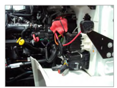
LOCATION OF REMOTE ENGINE CONN