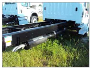
LOCATION OF EXHAUST