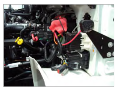
LOCATION OF REMOTE ENGINE CONN.