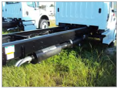
LOCATION OF EXHAUST