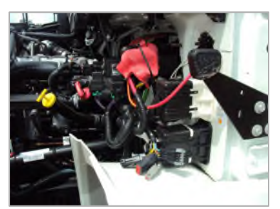
LOCATION OF REMOTE ENGINE CONN.