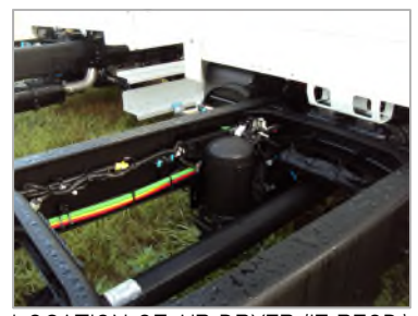
LOCATION OF AIR DRYFR (IF REOD)