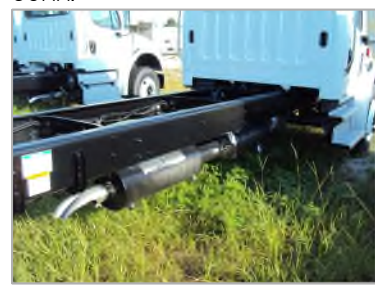
LOCATION OF EXHAUST