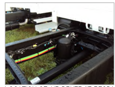
LOCATION OF AIR DRYER (IF REQD.)