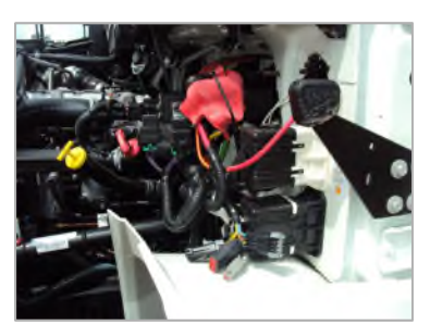
LOCATION OF REMOTE ENGINE CONN