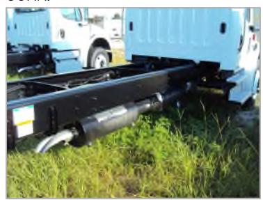
LOCATION OF EXHAUST